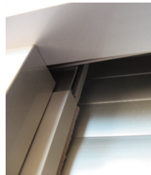
Aluminum guides for smooth operation.