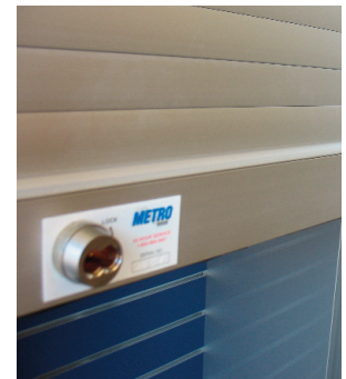
Mortise cylinder for ease of keying.

Metro Door's Rolling Shutters is the industry leading choice in business security offering peace-of-mind, dependable protection for a variety of applications, including retail, medical and government applications. These shutters were designed for the Kiosk and Millwork industry for ease of use and installation. Metro's 30 years of experience in developing security enclosures has resulted in an affordable, highly secure enclosure to protect against break-ins, theft and vandalism. Operation can be manual or motorized and each unit is custom manufactured to meet your needs. Give your business the security it needs, at an affordable cost with Metro Door's rolling shutters.